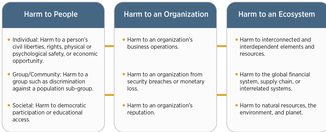
Fig. 1. Examples of potential harms related to AI systems. Trustworthy AI systems and their responsible use can mitigate negative risks and contribute to benefits for people, organizations, and ecosystems.